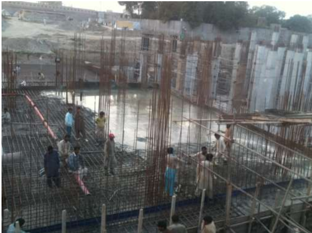
CMH (BHA WALPUR) EXTENSION.