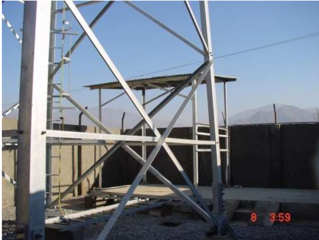
BTS Site Under Construction at Siadu Sharif Swat