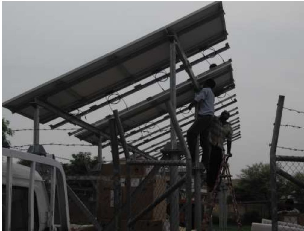
INSTALLATION OF SOLAR EQUIPMENT AT BTS SITES