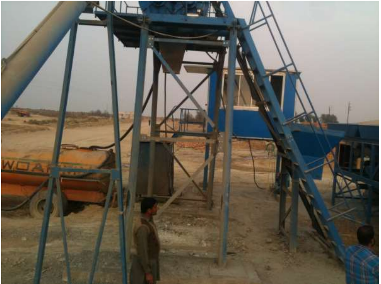
Concrete Mixer Plant